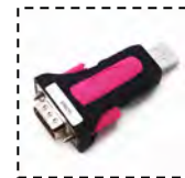
RS232 TO USB