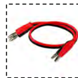
Test Leads (optional)