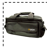
Soft Bag (optional)